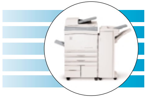
Network Multifunction Systems and Digital Copiers