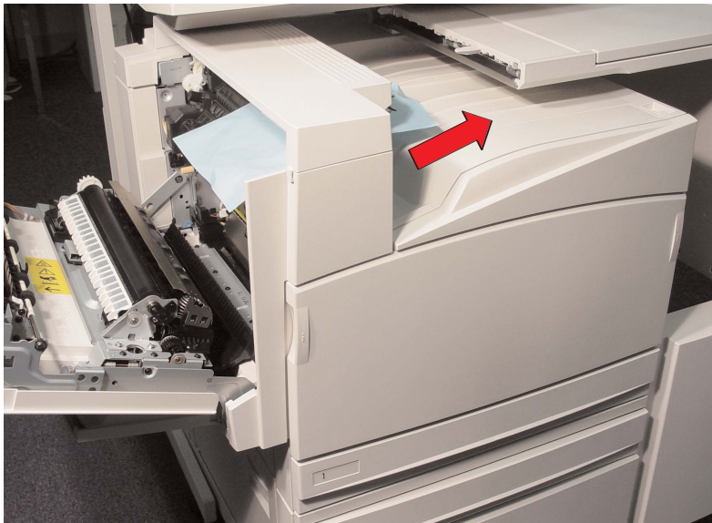
Fig. 2 If the edge of the jammed paper can be reached at the output tray, pull the jammed paper in the direction of the feed-out area.