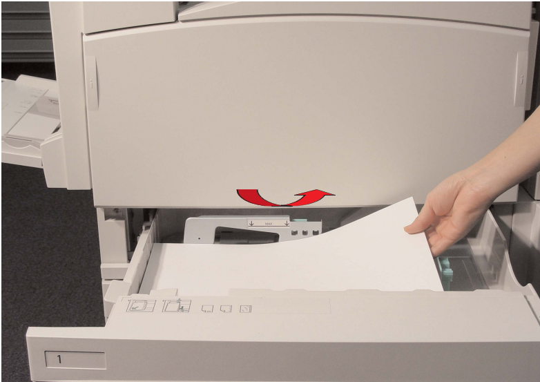
Fig. 9 Paper Tray 1 to 4 Remove the jammed paper.