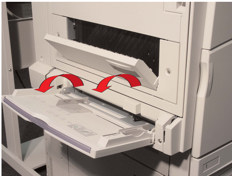
Fig. 4 Duplex Module Cover Open the tray 5 (Bypass) and gently open the duplex module cover.