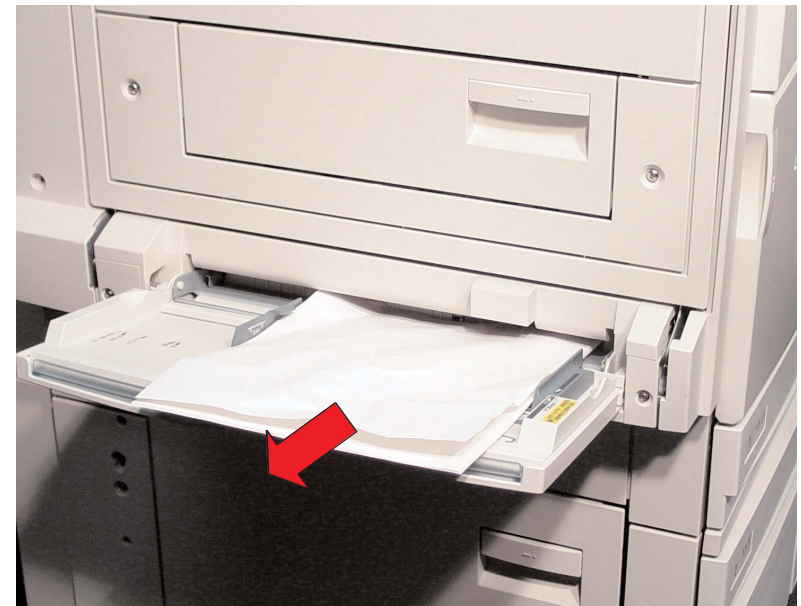
Fig. 6 Tray 5 (Bypass) Inspect the inside (paper feed entrance) of Tray 5 (Bypass), and remove any jammed paper.