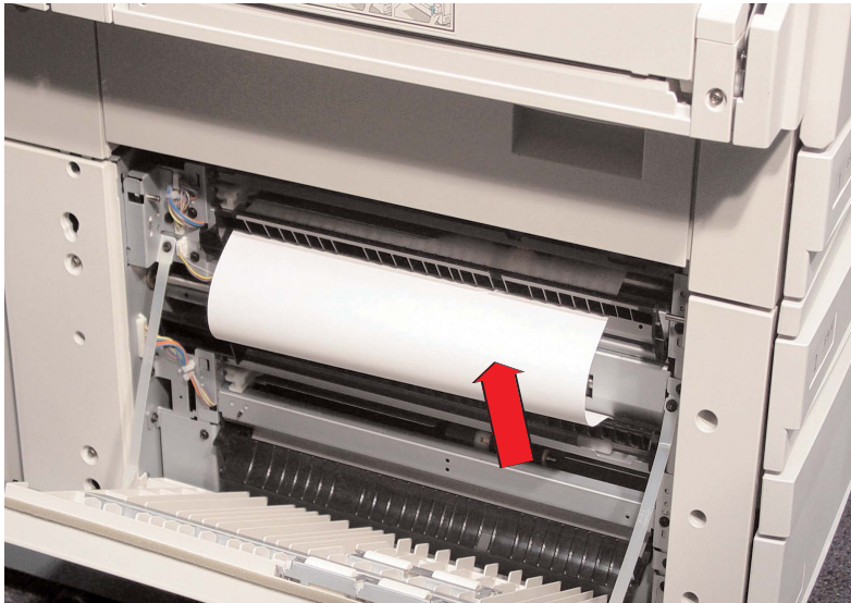
Fig. 8 Bottom left cover Remove the jammed paper.