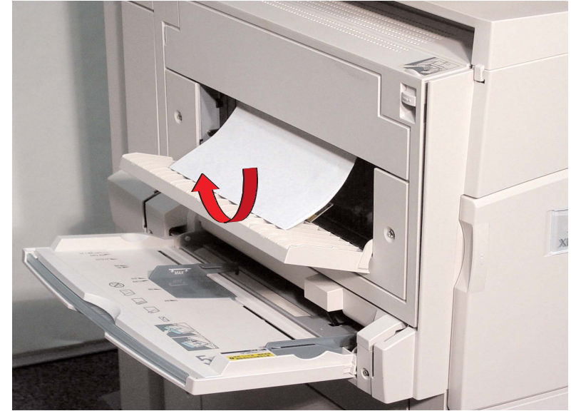
Fig. 5 Remove the jammed paper.