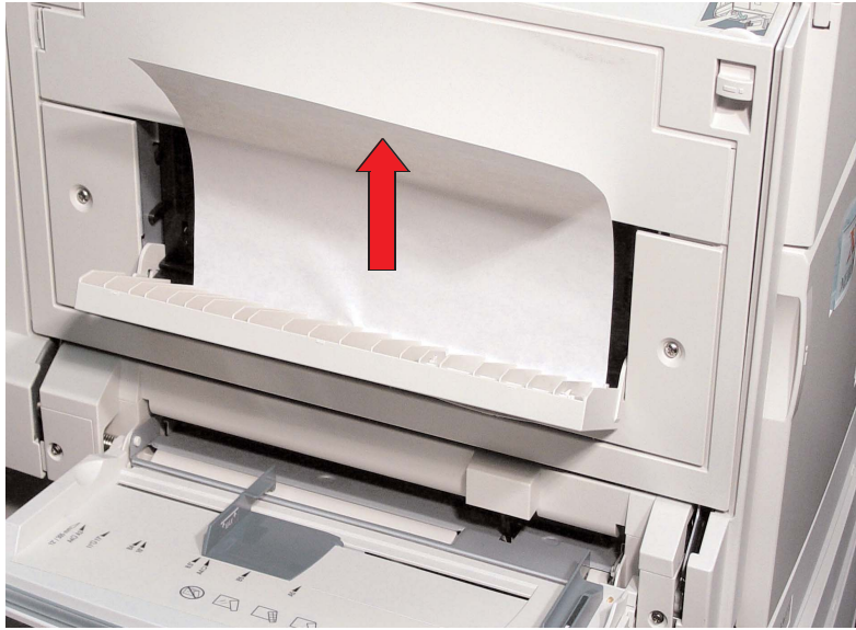
Fig. 7 Duplex Module Cover Remove the jammed paper.