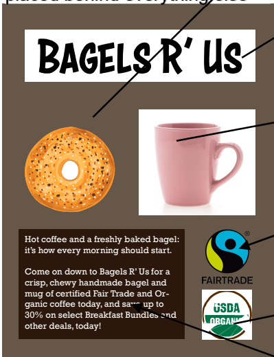
Document with "paper-substitute" placed behind everything else

Shop name is a bitmap in the original file. Re-creating it using text or as a vector-art object allows the surrounding area's paper to show-through.